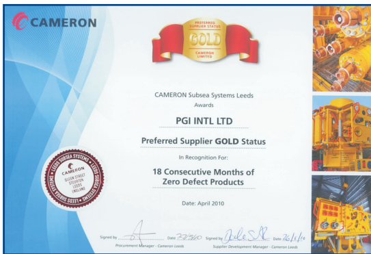
CAMERON Preferred Supplier GOLD Status 18 Consecutive Months of Zero Defect Products