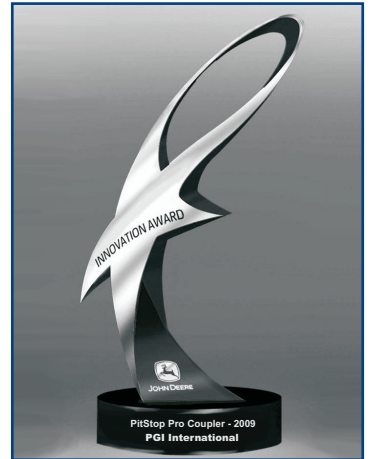
John Deere The 2009 Innovation Award