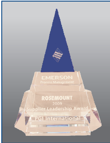
Emerson - Rosemount The 2009 Supplier Leadership Award