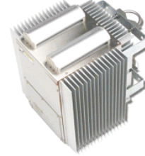
G-TEC™ Glycol ThermoElectric Battery Chargers