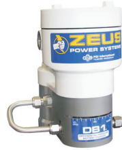
DB1™ Differential Pressure Battery Chargers